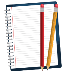
Workbook + Notepad