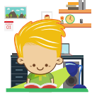
HOMEWORK / FREE TIME