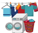
WASH MY CLOTHES